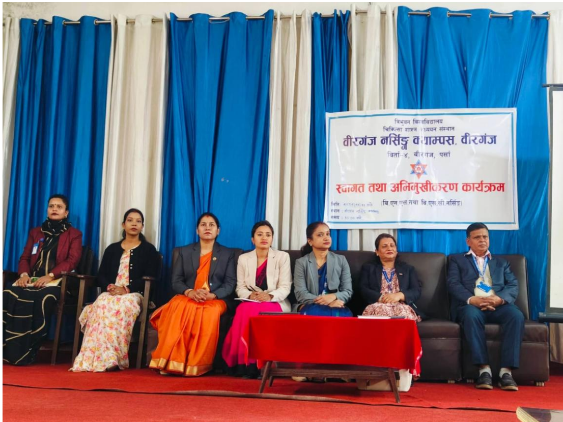
Orientation program of BNS and BSc. N