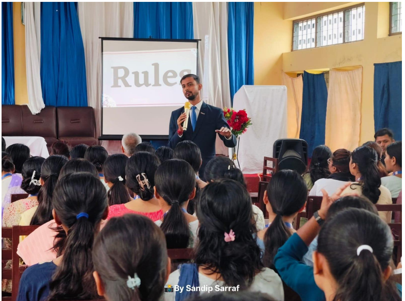
Training on Appreciative Inquiry for Nursing Students