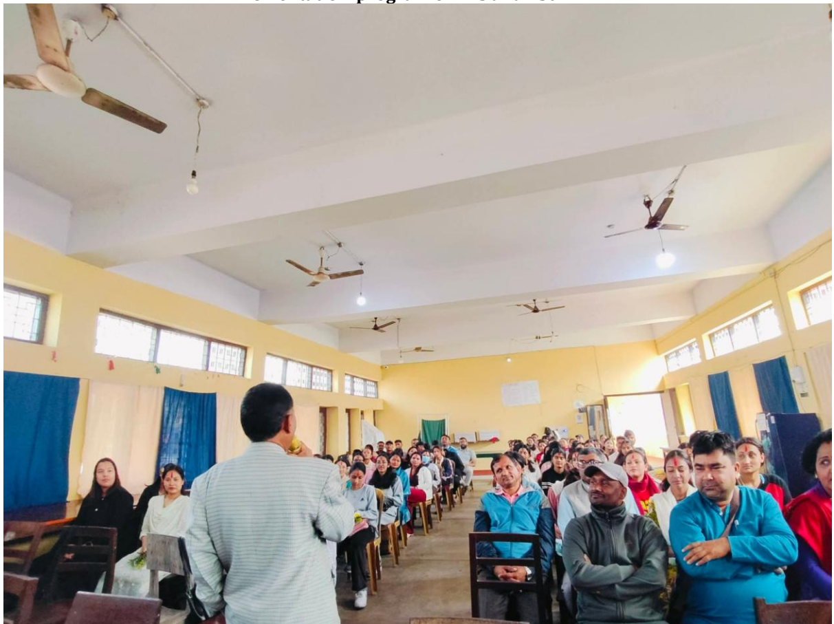
Interaction with guardians