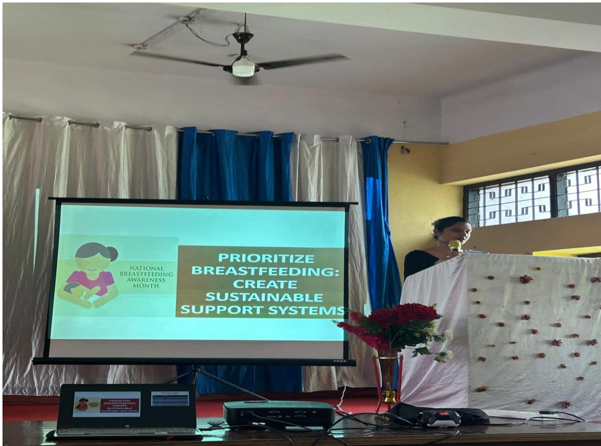
Breast feeding week 2025 celebration by Department of Woman's Health & Development