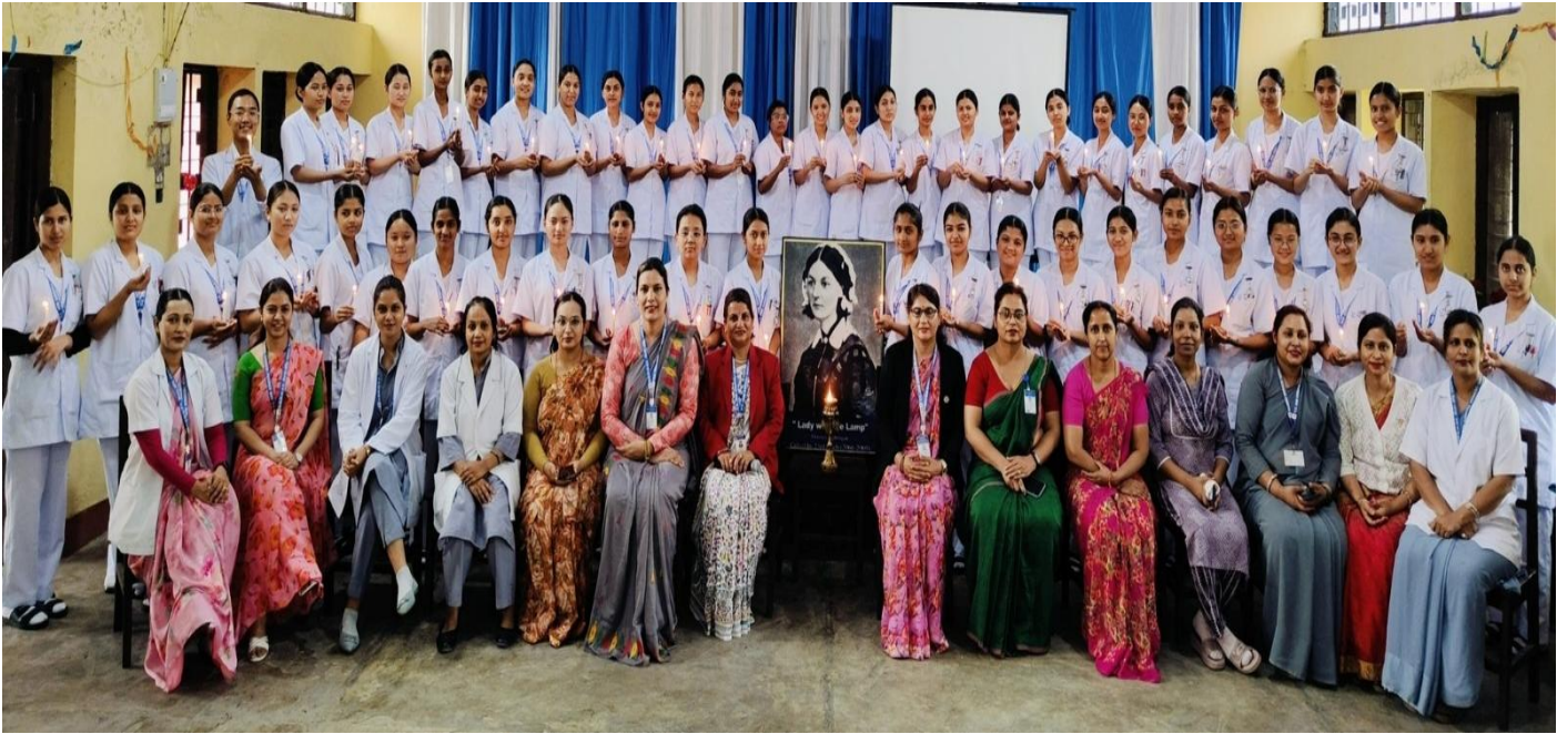
Oath taking Ceremony of B. Sc. Nursing 5 th batch