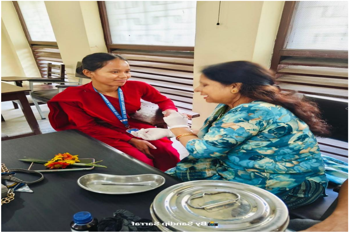
Free Dental Health checkup in campus