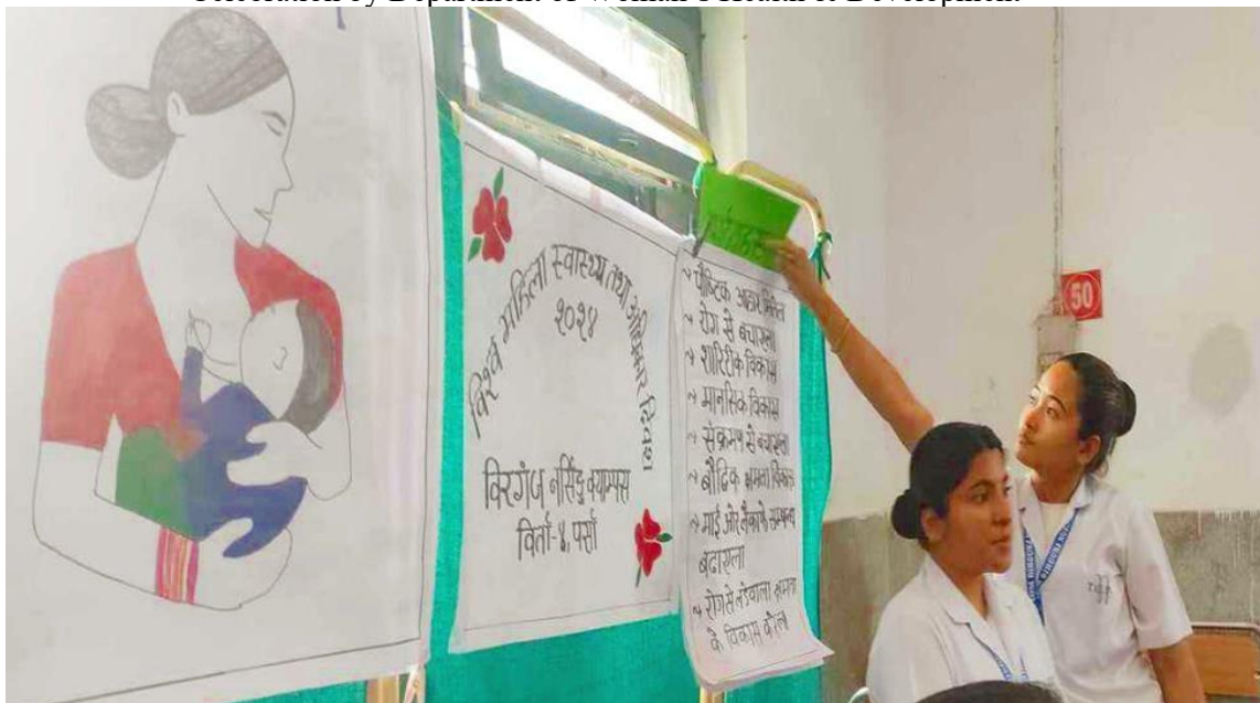
Orientation and Sensitization program organized by Department of WHD on occasion of "World Women Health and Rights Day" on 2025, April 12

Celebration by Department of Woman's Health & Development