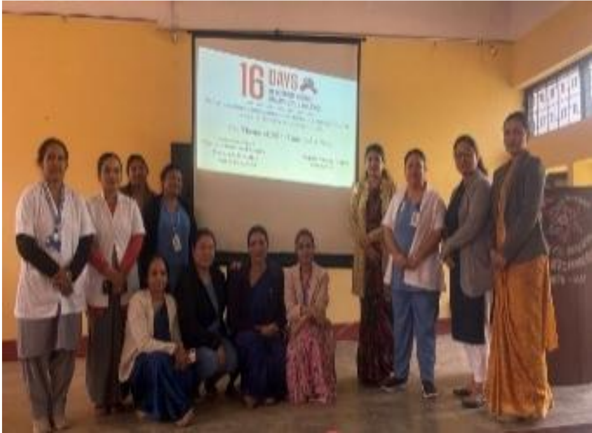
16 Days Activism against Gender Based Violence 2025

Celebration by Department of Woman's Health & Development