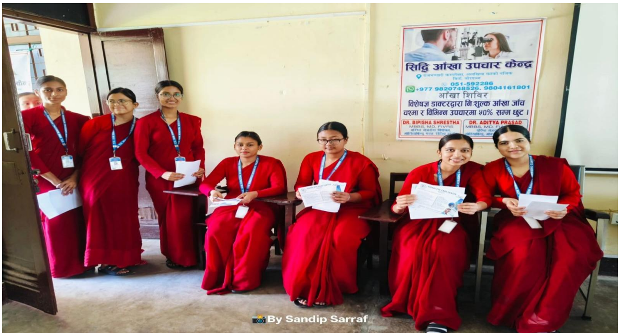
Free Eye Health check up