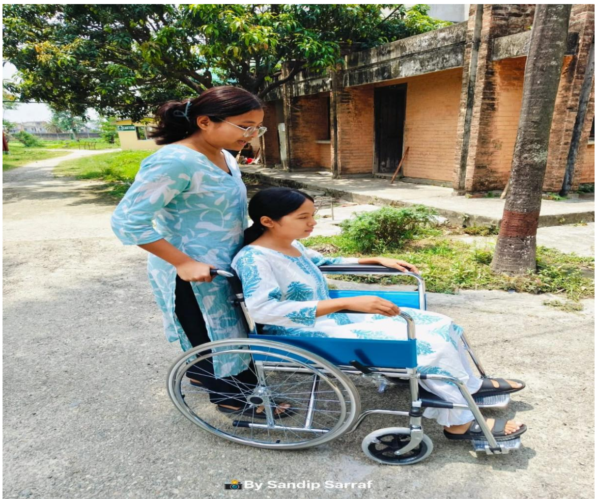
Non-credit course training for BSc. Nursing on "Humanity and Wellbeing in Nursing Profession"