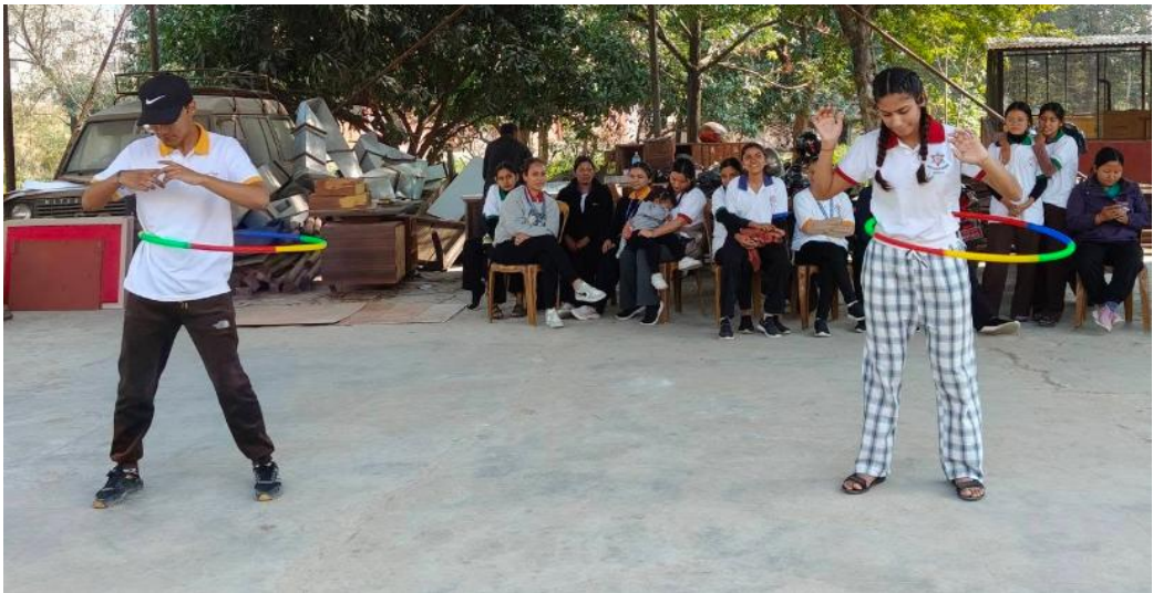
Sports week 2082