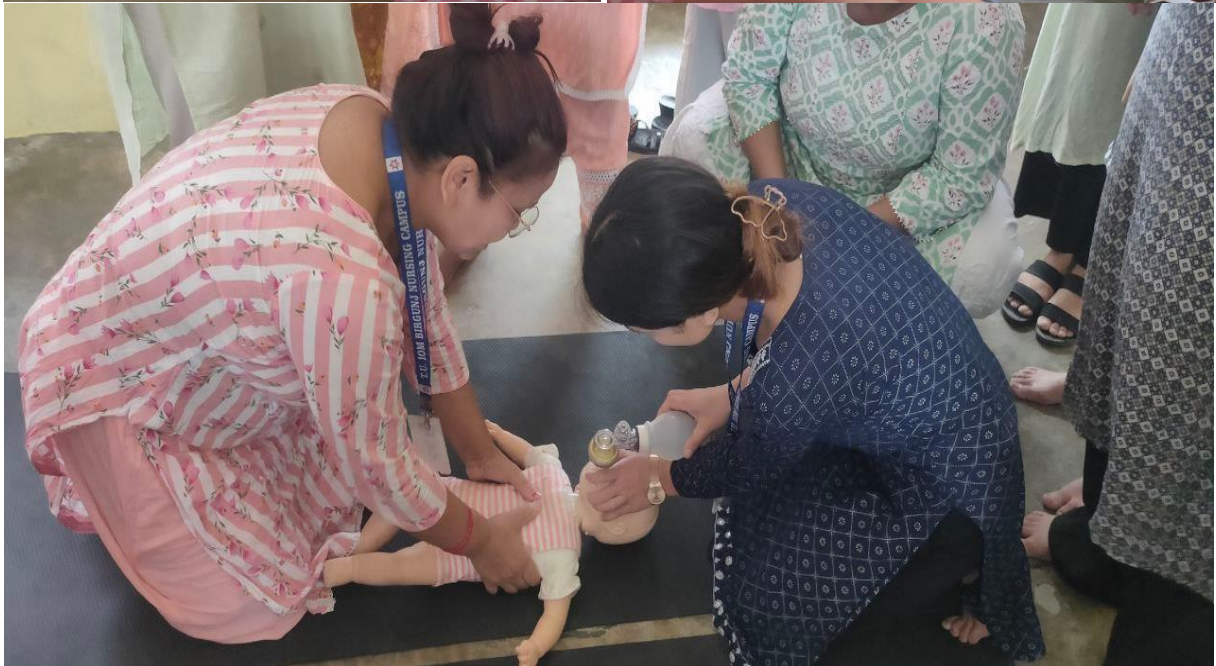
Training on “Basic life Support” for BNS and BSN students conducted by Department of Adult Health Nursing