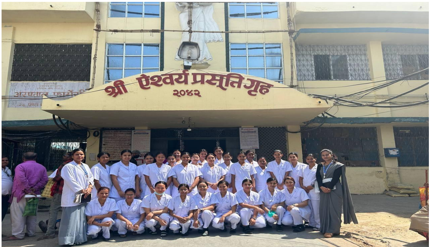
Clinical orientation of BNS 14 th Batch in Narayani hospital