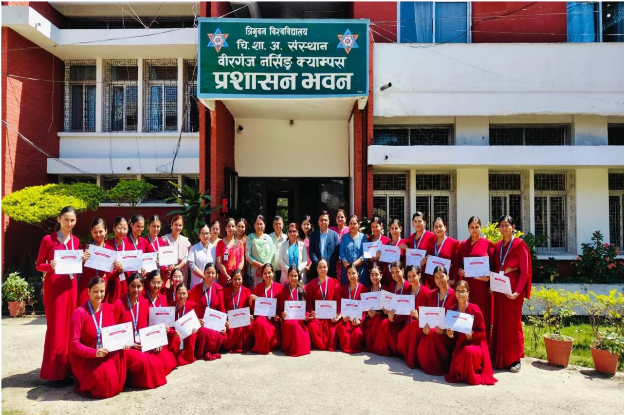
Training on "Literature Review and Database Search"