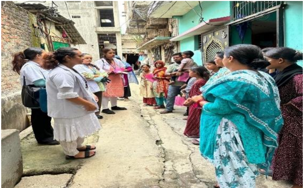
Health Awareness Programme on Cholera outbreak in Birgunj